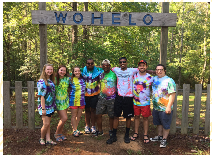
Camp Fire Alabama

$100 supports a kid or teen get life-changing life skills they need to be the best person they can be today.