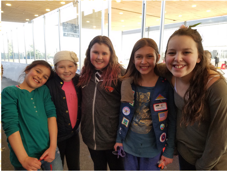
Camp Fire Central Oregon