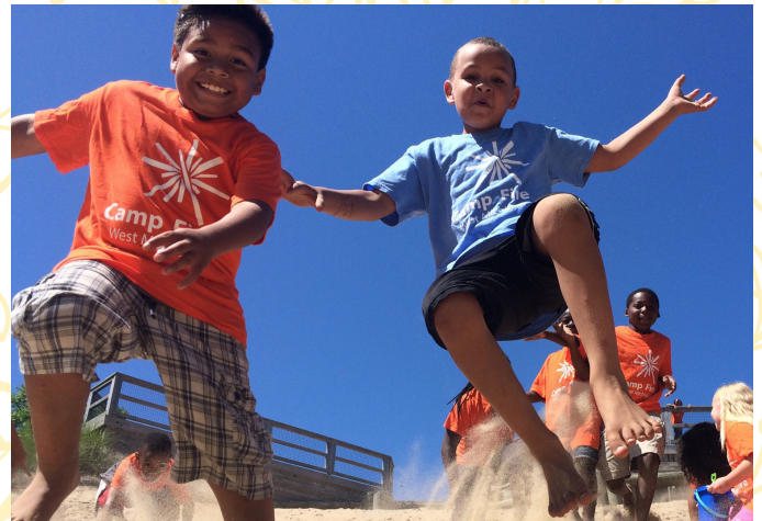
Camp Fire West Michigan 4C