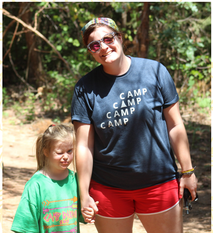
Camp Fire Heart of Oklahoma