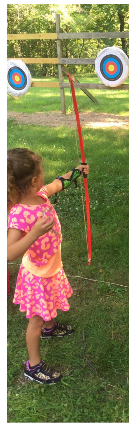
Program Year 2015 Statistics Shown

Youth surveys show statistically significant increases from pre- to post-evaluation on all indicators of thriving.